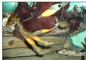
■ EMBRYOS of these dogfish can clearly be seen in their egg cases.

"Suffice to say I've never known of a shark attack in North Devon...long may that continue!"